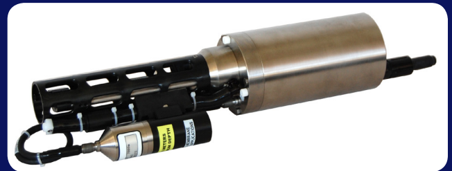
Shown with optional SBE 43F Dissolved Oxygen Sensor

The SBE 52-MP's pump-controlled, TC-ducted flow minimizes salinity spiking, and its 1 Hz sampling provides good resolution of oceanographic structures and gradients on typical slow-moving packages (20-50 cm/sec). Data are output in real-time in engineering units (mmho/cm, °C, decibars, ml/l) or raw hex or binary.